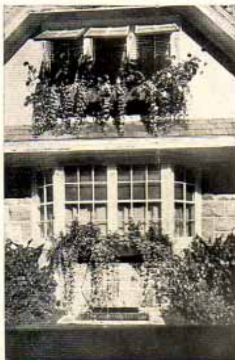
In any box trailing vines should appear.

second story, the new cardinal climber is a delightful, graceful thing, easily grown from seed which should be started in glass in the house or hot bed and planted out when danger of frost is past. Cobaea scandens is another most excellent climber which blooms persistently from base to tip of the plant, its large, bell-shaped blossoms — which open a greenish cream and change through all the shades of lavender and mauve to a deep wine—are very conspicuous and beautiful