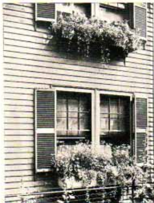
Plants can be kept back to the desired height.

North window boxes will always be a delight to the owner as there is no other position in which plants do so well. Nearly all house and greenhouse plants may be grown to perfection there, especially the ferns and begonias, and many of what are known as sun loving plants will do admirably if they receive the morning