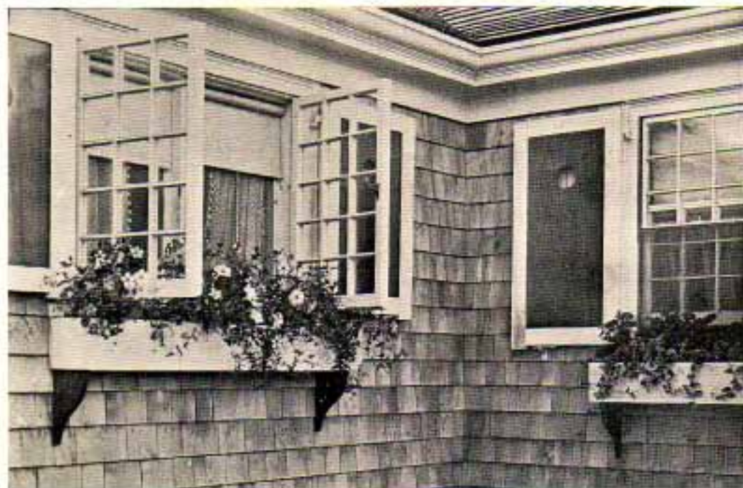
One should always plan to grow something fragrant in the window boxes.

Abundant water is necessary and this, fortunately, is available by the use of the