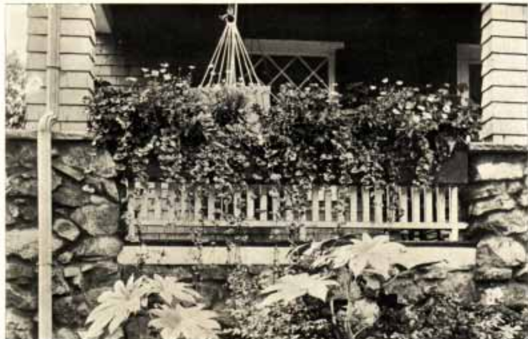
The porch flower box.

By filling boxes with soil and placing them in the cellar and planting early in January bulbs of tulips and hyacinths, later those of crocus and narcissi, one may have these popular bulbs blooming in the windows at about the time other people are having them in their gardens. This is especially of interest to the dwell-